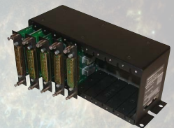
SRU 10 Ten Card Enclosure