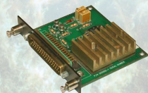
SA 3/SA 3L/SA 3NVG