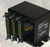
SRU 5 Five Card Enclosure